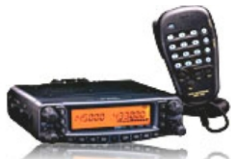
The Yeasu FT-8900R

To this end the committee agreed the purchase of a Yeasu FT-8900R, which is a quad band radio (for 10, 6 & 2 mtrs plus 70cms). Ten metres is of no interest but the unique thing about this rig that it has a cross-band talk-through facility (any band to any band) without the need for any modification.